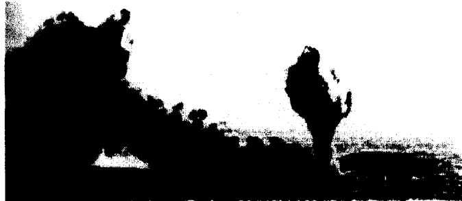
"Scratch one flattop!": Shoho burning fiercely, not much short of sinking.

Fletcher meanwhile decided that the destruction or interdiction of the Port Moresby group was the prime goal, and set off toward the Louisiades again. Takagi turned his planes around after their landing, hoping to find the U.S. carriers. Luck was not with the Japanese aviators. Bad weather made for visibility measured in only a few kilometers, and again, the close proximity of both forces made for interesting situations. Heading back for their carriers rather late in the evening (having only been launched at 1630 hours), they ran into the US carriers, and their air units. Nine bombers fell while two Wildcats did the same, and the day was not yet over for the Japanese. Finding a carrier at the edge of their fuel supply, several planes descended.