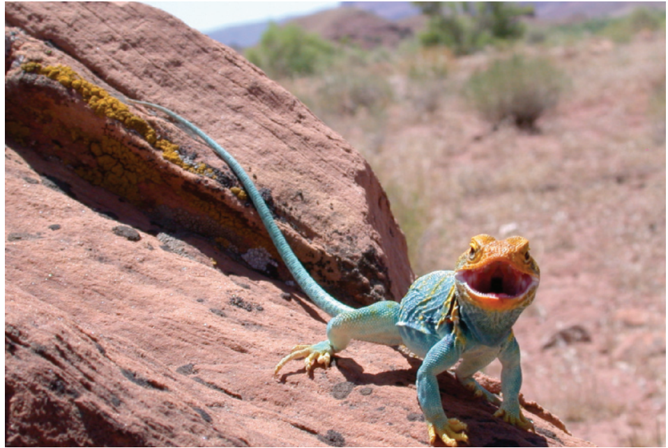
A. K. LAPPIN

The main weapon of these lizards is their bite — about which contenders might want information if they are to decide whether or not to join battle. From measurements of bite force and of the jaw muscles inside the mouth, Lappin and his co-workers conclude that the size of the muscles, shown during gaping, provide a bite-force indicator. Hence the display — the message of which, the authors suggest, is amplified by conspicuous white patches at the corners of the lizard's mouth.